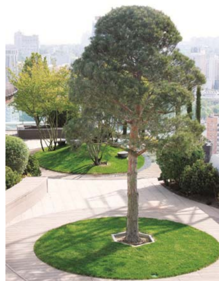
The garden centrepiece, a pine over 7 m tall and weighing 5 t.