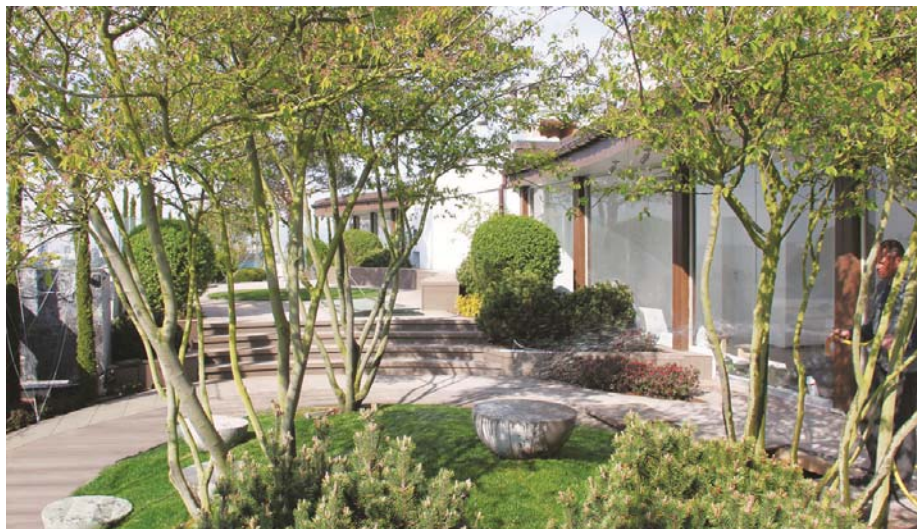
Depending on their depth of growth, various lawns, perennials, shrubs or small trees were planted.