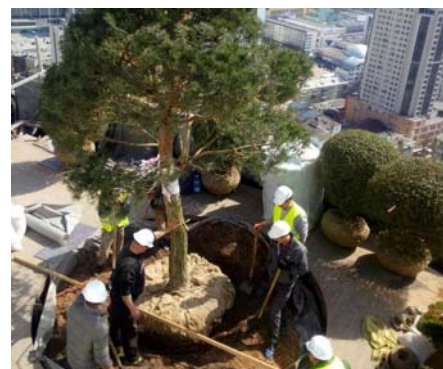
The latest Green Roof Technology enabled tall trees, such as Canadian Shadbushes, pine and maple (3.5–7 m), to be planted. A specially designed technological device which anchors the root ball of the central pine was used.