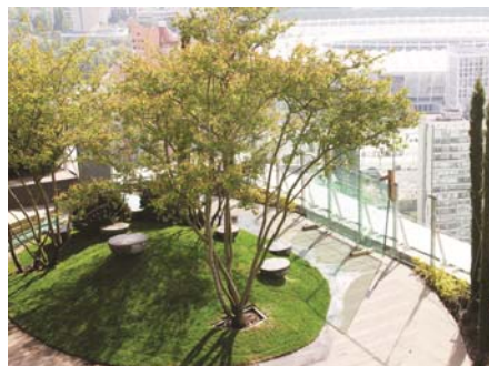
Incredible view over the central part of Kiev.