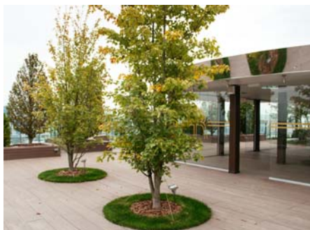
Outdoor recreation is possible within the city on the 32 nd floor.